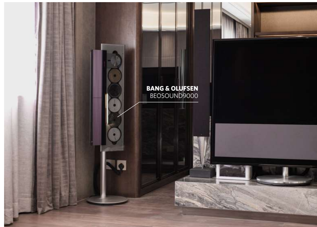
BANG & OLUFSEN BEOSOUND9000

為讓空間彰顯藝術感，特意選上具併花效果的雲石和牆紙，使紋理及圖案連貫，渾然一體。雲石的永恆魅力，為屋主不斷增加的家具收藏提供完美背景，確保家居歷久常新。