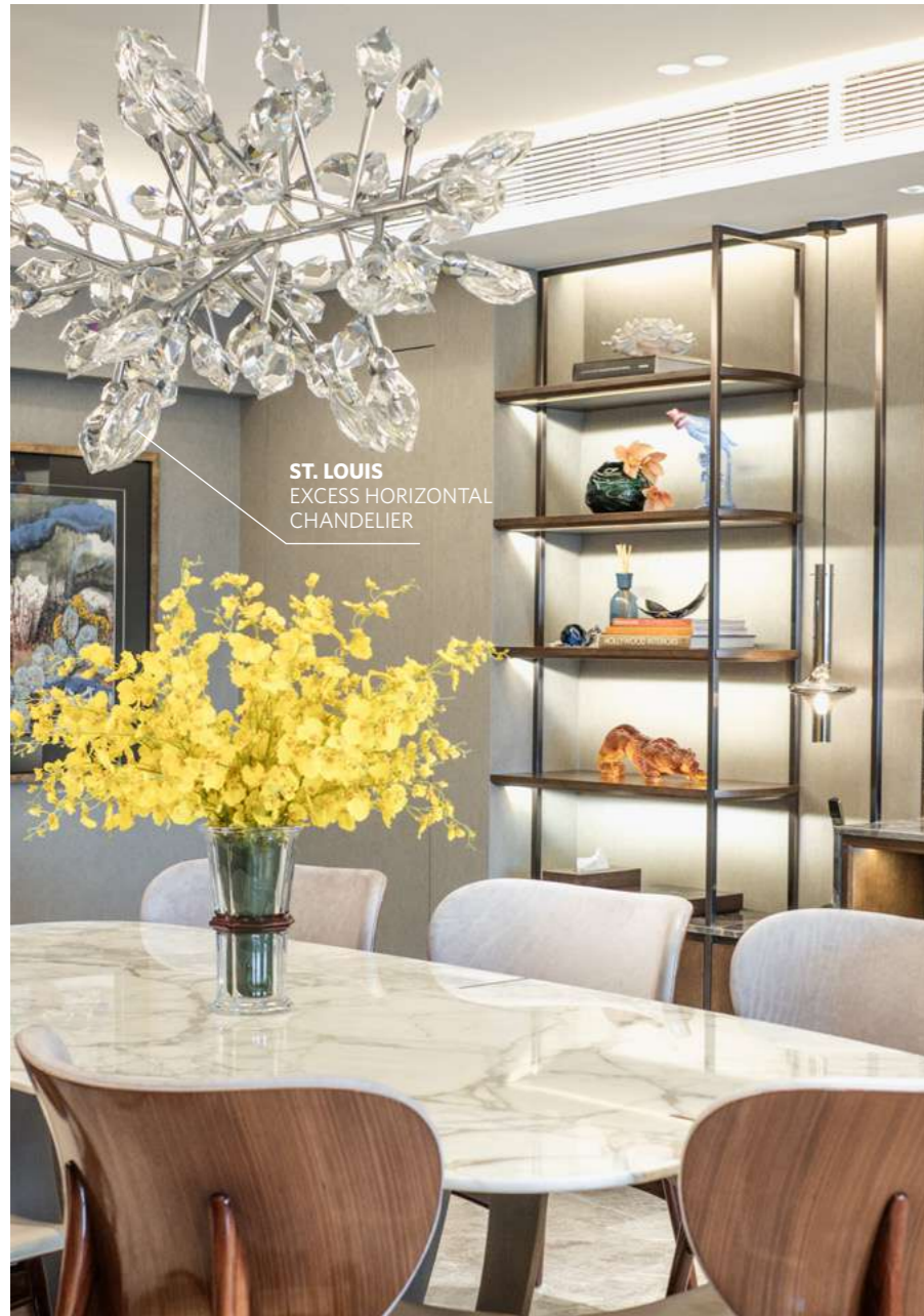
ST. LOUIS EXCESS HORIZONTAL CHANDELIER