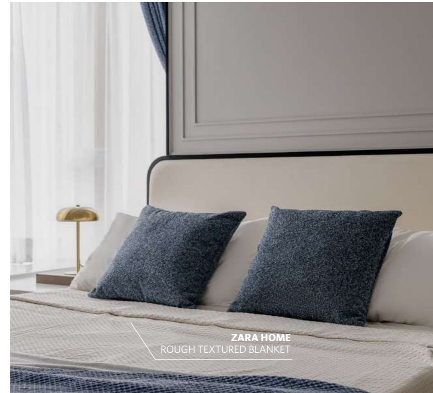
ZARA HOME ROUGH TEXTURED BLANKET

設計師縮小廚房，以騰出更多客廳空間，並在玄關位增設全高收納櫃，呈柔美的弧線輪廓，一直延伸至飯廳，讓動線更舒適流暢。